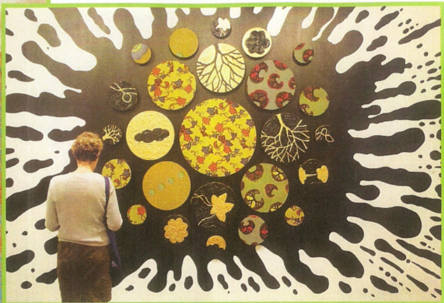
L.: Art Kabinett, Beatrice Wood, Un Peut d'Eau dans du Savon ; Above: From Friedman Gallery in London